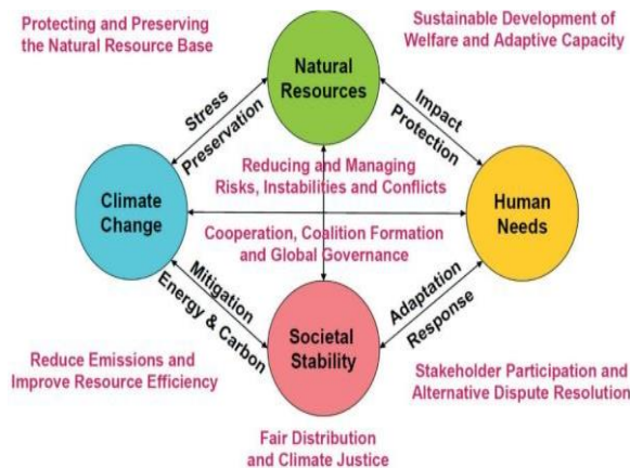
Figure 1. The Rescue Strategy for Disasters with Integrated Working Framework [16]

The integrated disaster rescue strategies can be seen in the following figure 1: